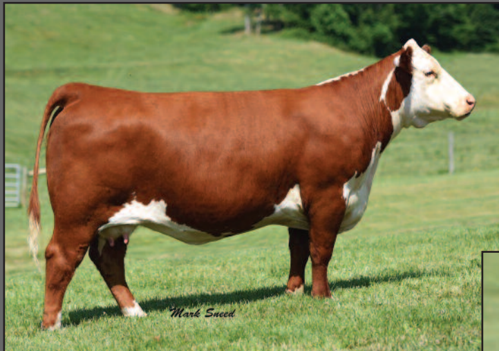
CFCC EF Amaryllis