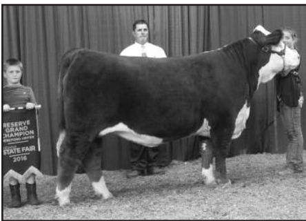
Reserve Champion Heifer LLE Plums Estelle Exhibited by Libby Dixon