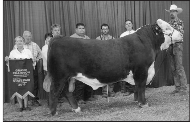
Champion Hereford Bull: WCC Selton Sea C304 ET Exhibited by Wilson Cattle Company